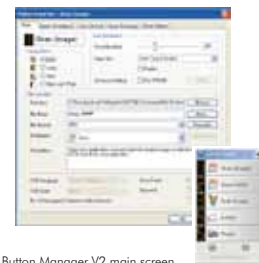
The Button Manager V2 main screen

Button Manager V2 makes it easy for you to scan and send your image to your favorite destinations with a press one button. Now the new version comes with an innovative feature to let you scan and automatically upload the scanned document to popular cloud repositories such as Google Docs, Microsoft SharePoint, or FTP. In addition, the iScan feature allows you to insert the scanned image or recognized text after optional OCR (Optical Character Recognition) process to your text editor such as Microsoft Word to get your job done easily and quickly.