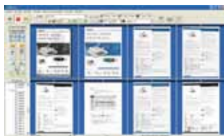
The AVScan X main screen

-The Intelligent Document Management Tool