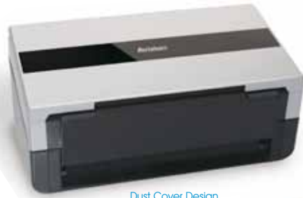
Dust Cover Design