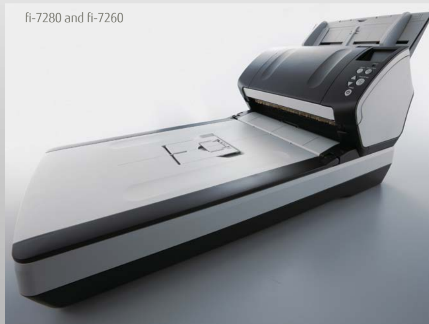
fi-7280 and fi-7260

Carrier sheets allow you to scan documents, larger than A4 or photos and clippings that are at risk of being damaged when processed through an ADF. {Part Number – PA03360-0013}