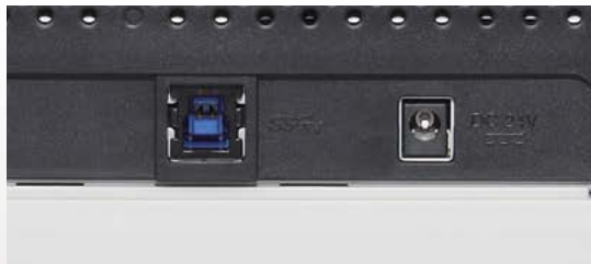
High speed performance through USB 3.0 interface

All four scanner models additionally make use of an ultrasonic sensor that accurately detects multifeed errors where two or more sheets are fed through the scanner at once plus intelligent multifeed function that is designed for documents that intentionally feature paper attachments of defined sizes or locations such as sticky notes or photos. The scanner can automatically recognise the location of the attachment and will then exclude that zone from triggering alert conditions.