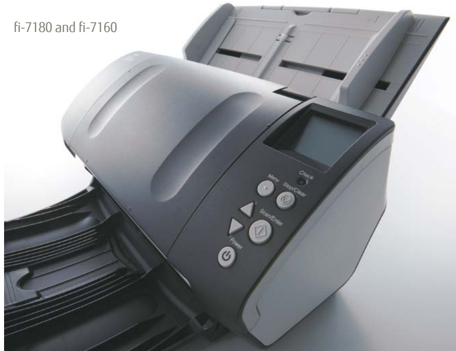
fi-7180 and fi-7160