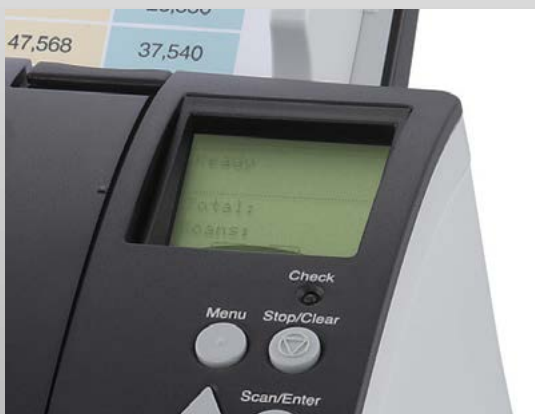
Integrated LCD operating panel

The fi-7180, fi-7280, fi-7160 and fi-7260 come with Scanner Central Admin tools that includes functions that system administrators can use to manage the installation and operation of multiple scanners, monitor operation status and update drivers and software from one location. This ability dramatically reduces the cost and work that goes into setting up, operating and maintaining many scanners in an organisation and also in expanding the scanner network to multiple locations.