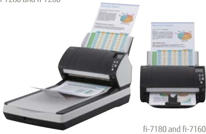
fi-7180 and fi-7160

fi-7160/fi-7260 – A4 Portrait at 300dpi 60ppm/120ipm fi-7180/fi-7280 – A4 Portrait at 300dpi 80ppm/160ipm Scan mixed batches up to 80 sheets